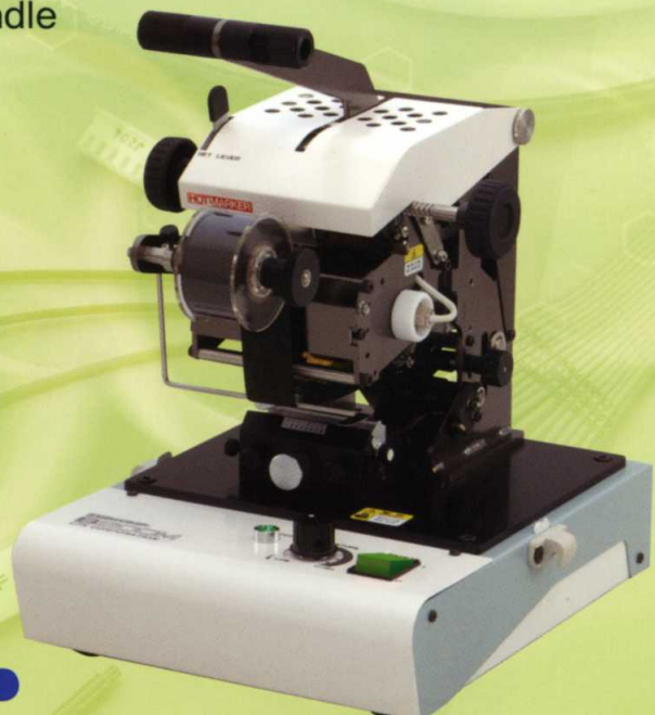
Photo: B200M with optional head unit G

Manually operated Easy operation – just press down the handle Suitable for small lot markings